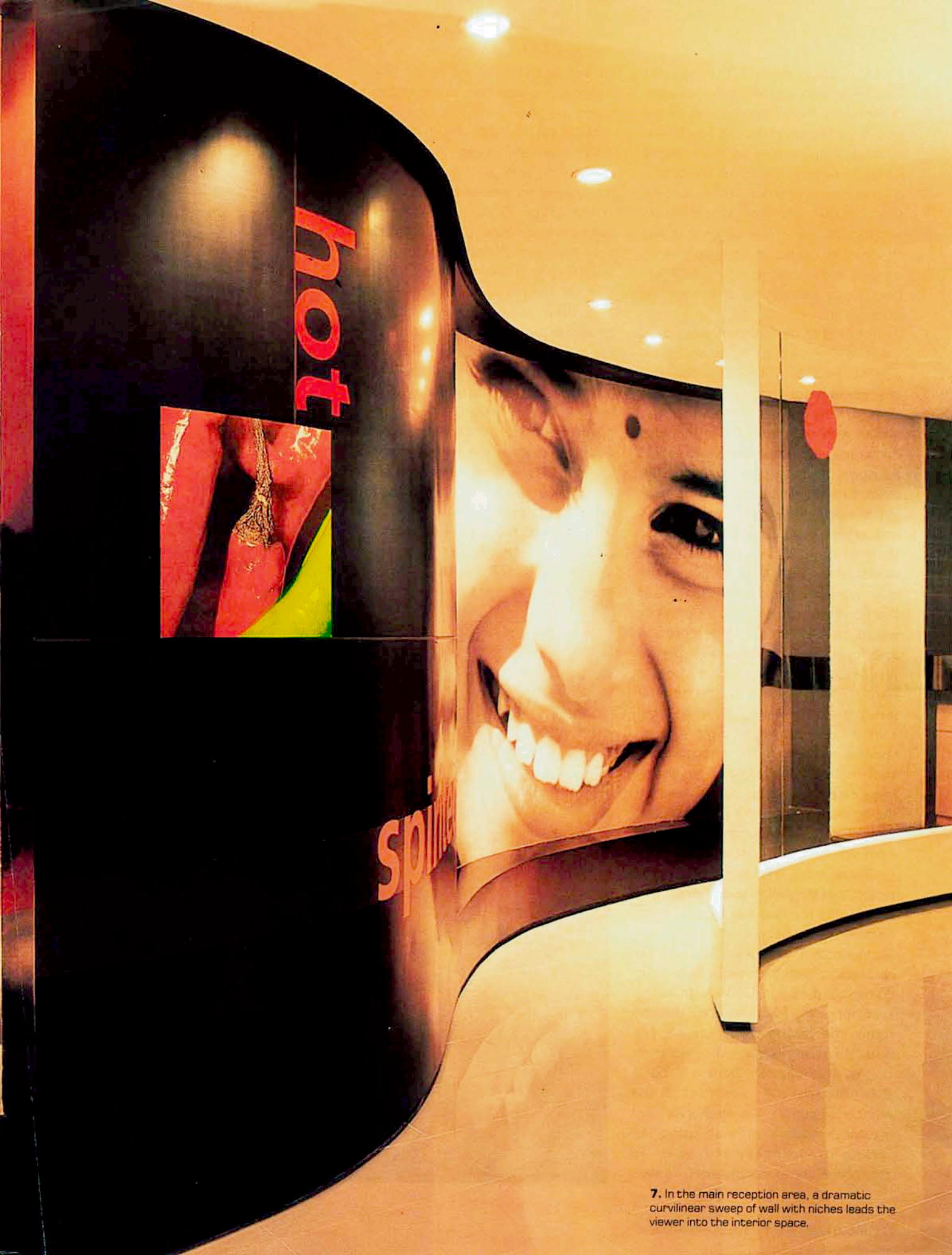
7. In the main reception area, a dramatic curvilinear sweep of wall with niches leads the viewer into the interior space.

Indya.com, one of the popular websites in India and also Indya.com one of the largest India related portals on the web, is the Microland Group's new Global Internet Venture. It is an India-related portal that allows the visitor access to a diverse range of information ranging from politics to Bollywood, from astrology to music. The office that was designed is located in Bangalore in an existing four-storey building that has been totally restructured and renovated from within.